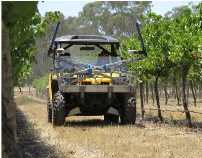
Figure 1. Demonstration of NDVI sensor technology

PV tools such as EM38 soil Mapping and Plant Cell Density Mapping (PCD) have been used for several years. Use of PCD has enabled the following zones to be identified: