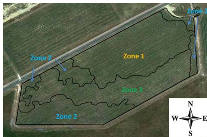
Figure 3: Vineyard zones of the experimental block at Mount Langi Ghiran

The combined use of EM38 soil sensing, PCD mapping, temperature data loggers and the identification of spatial trends in the distribution of the grape compound rotundone, has led to the production of one of the world’s first grape attribute/quality maps. This study aimed to identify the environmental factors which contributed to fruit quality, in the hope of identifying further “quality” zones and increase the potential production of the iconic Langi Shiraz. Cheers to that!